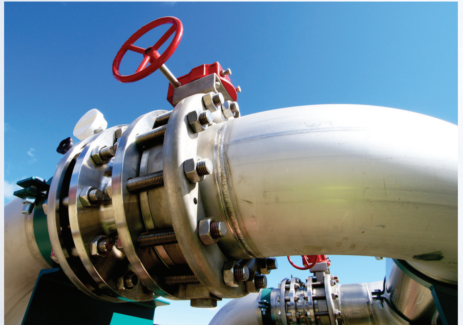
EagleBurgmann develops custom tailored sealing solutions for pipelines.

These requirements were best met by the SHV series which has proven itself thousands of times over in crude oil pumps and MOL pumps